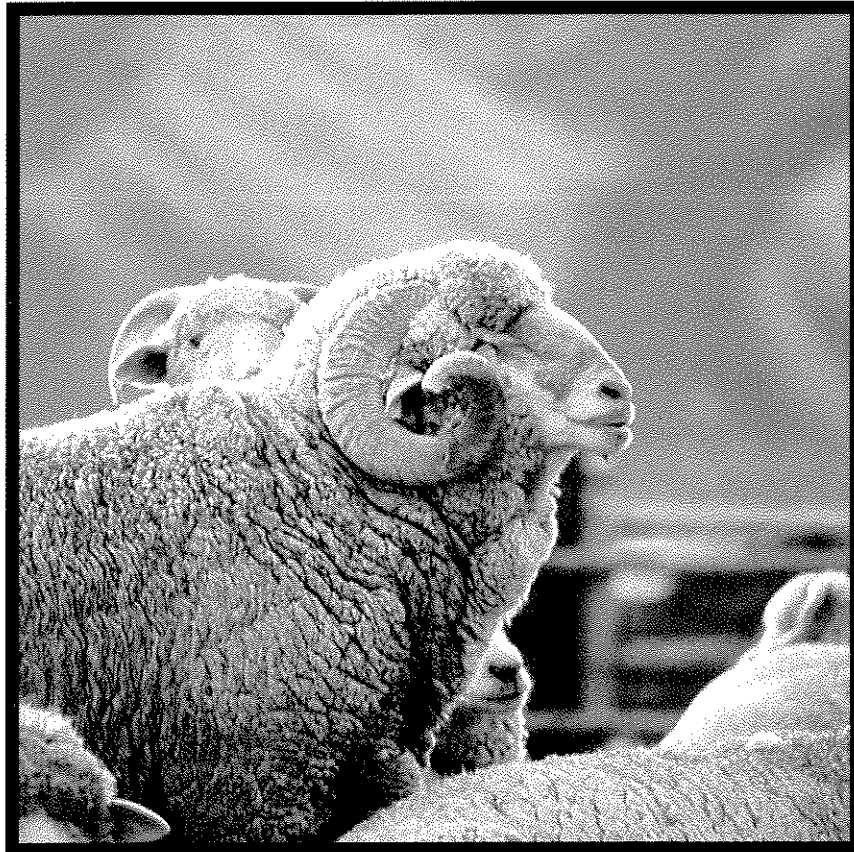
The spiral shape of a ram's horn